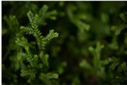
TE KĀHUI RAU: TE TAI AO STRATEGY

The Te Kāhui Rau: Taiao Strategy 2024-2029 is an intergenerational plan to design the future we want as ngā uri o Ngāti Tāwhirikura.